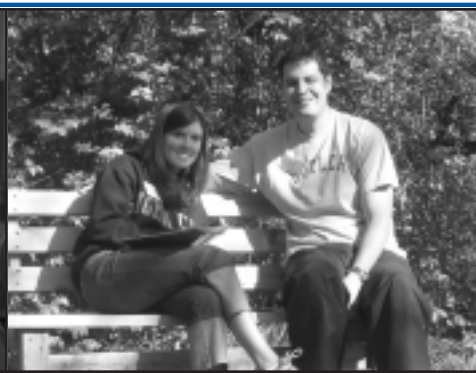
An engaged couple enjoying a Tobit moment