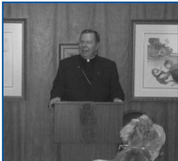
Archbishop Daniel Buechlein leads a Day of Reflection for over sixty retreatants

“The Lord is close to everyone who prays to him, to all who truly pray to him.”