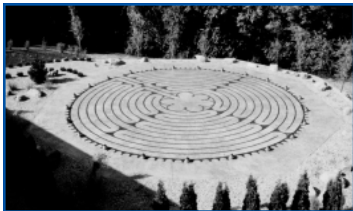
Our Lady of Fatima's full-size labyrinth sits behind the chapel on the west side of the building

The walk from the entrance to its center represents a purging or letting go of the things that block communication with God.